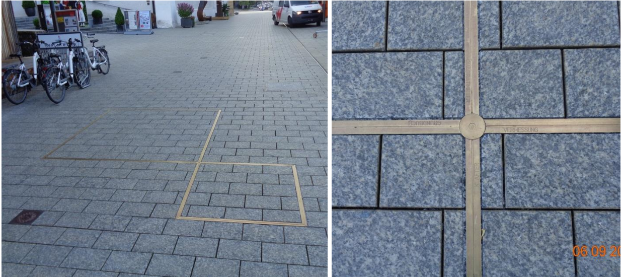
Image 1 Klafter installation made of brass